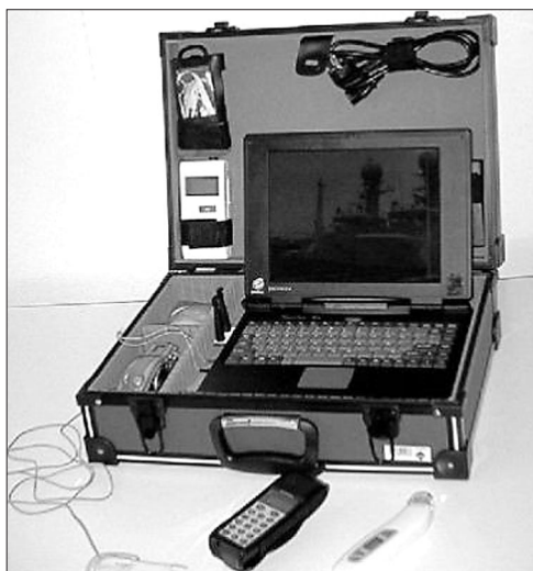
Figure 2. Telemedicine kit.

One important factor concerns the registration of the information and data onboard and at the receiving hospital.